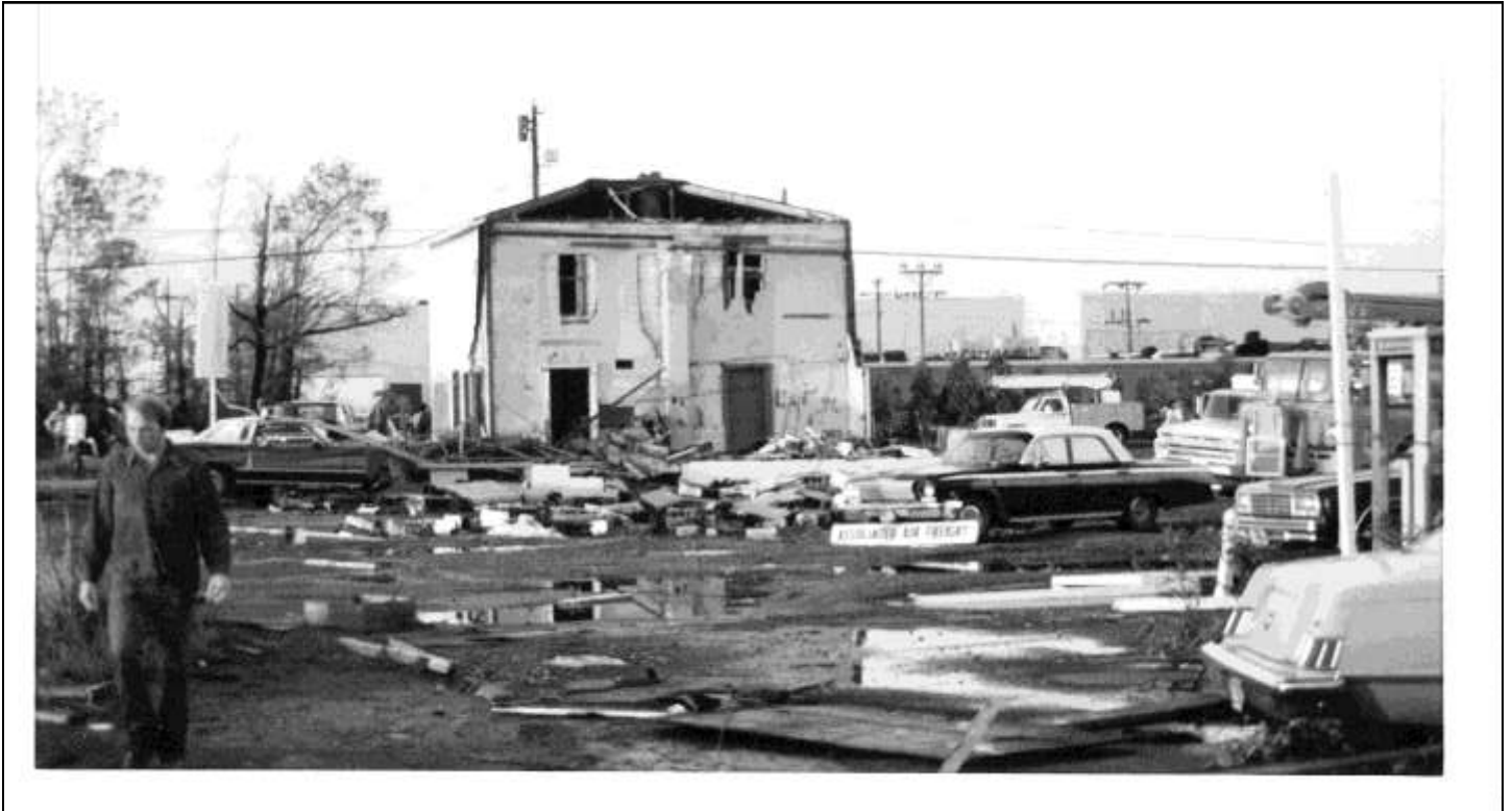
1979 tornado damage.

Next month marks the 30th anniversary of an F4 tornado that hit the village of Poquonock and killed three people. An F4 tornado has winds between 207 and 260 mph, can level well-constructed homes, and create heavy projectiles. An F5 has the highest intensity. When the tornado left Poquonock, it went on to flip over jet planes at Bradley International Airport and destroy historic aircraft at the Bradley Air Museum. Though these violent storms can happen in any state, Connecticut ranks number 42 out of the 50 states for tornado frequency. In fact, between 1950 and 1995 statewide we had 61 tornadoes with four deaths. We've written about this event before in this newsletter, but I thought I'd share a personal perspective of this big event.