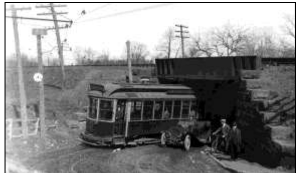
Trolley and automobile posed near "The Death Trap" under the railroad bridge to Palisado Avenue.

Trolley operators had their share of trouble. Account books housed in the Dodd Research Center at the UConn/Storrs campus from the Hartford Street Rail Company dating between 1894 and 1907 report many accidents and deaths. We know that in 1894 there were