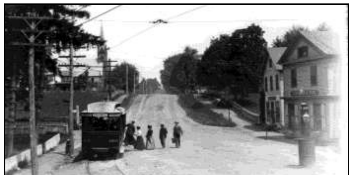
St. Joseph's Catholic Church in Poquonock center, 1895.