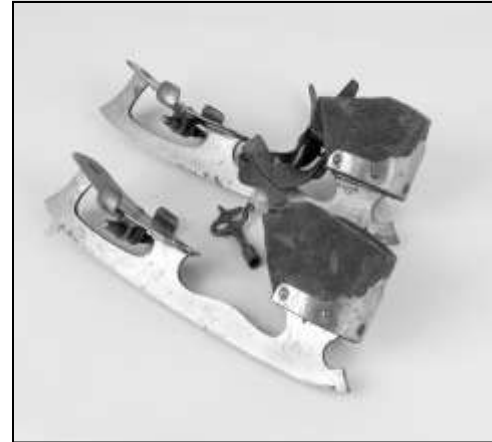
Figure 1 Winslow Ladies' Skates with key, 1875-1920 WHS Collection 2010.1.36