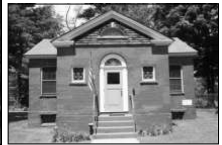
1195 Windsor Avenue