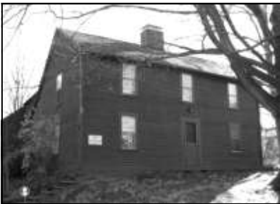
1174 Windsor Avenue