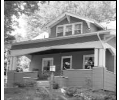
101 Hayden Station Road