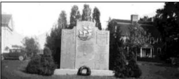
The Founders Monument on Palisado Green, 80 Years Old